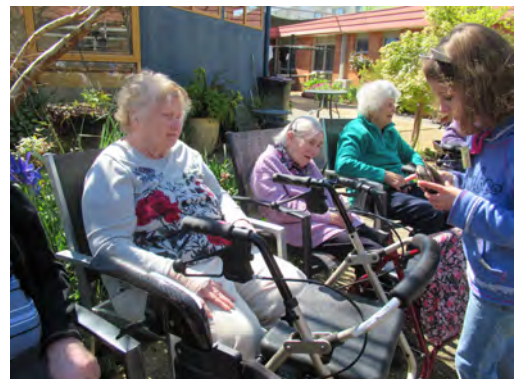
Fun and games at our Annual Mobile Farm and BBQ Day!