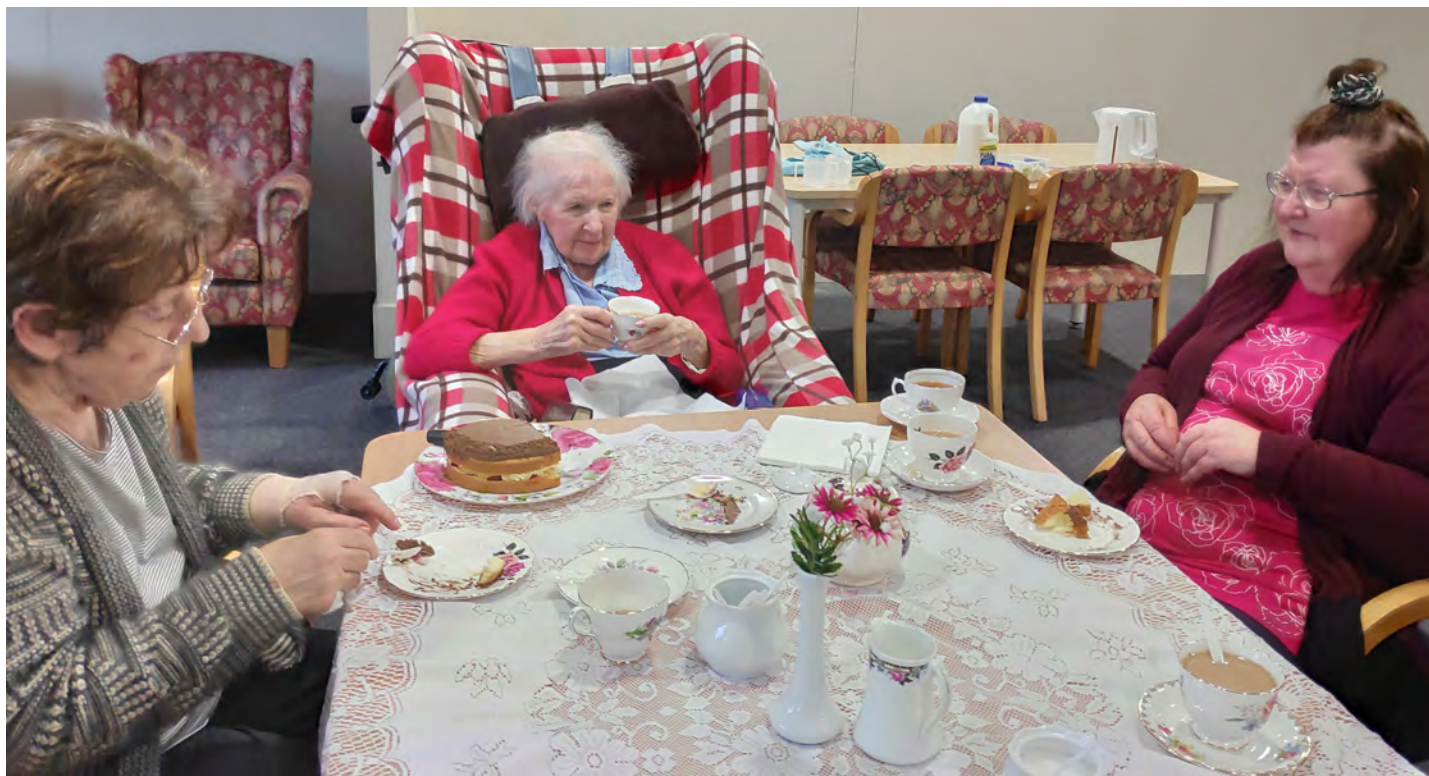
~ Taking Time for Tea ~