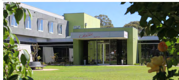
BELOW - Olivet in 2016 before construction commenced on our "New Willows" building.