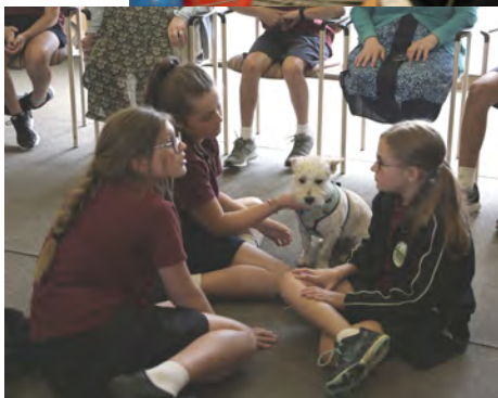
Fun and games with the gang from Heritage College!