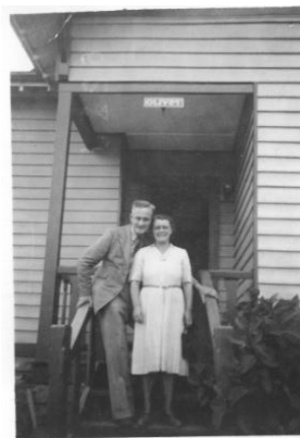
LEFT - one of the earliest photographs we have of Olivet