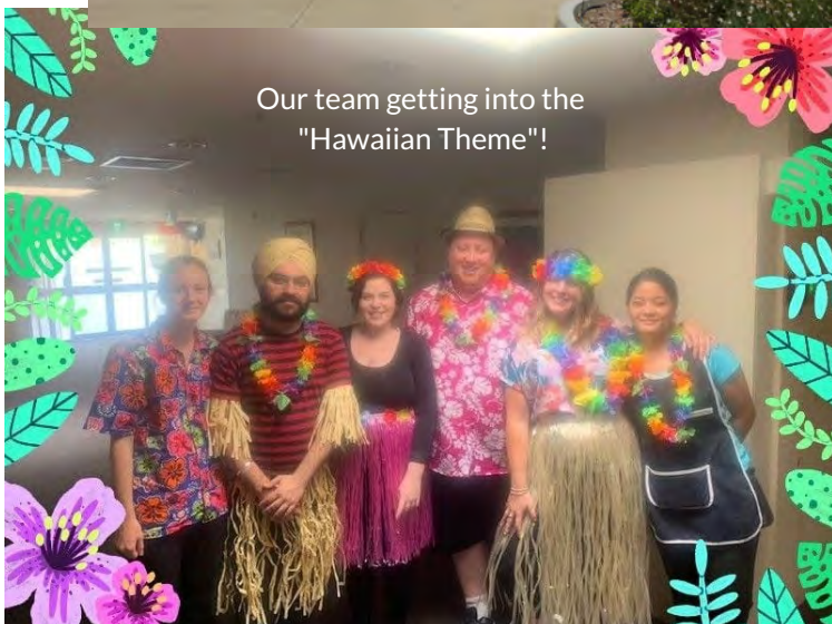
Our team getting into the "Hawaiian Theme"!