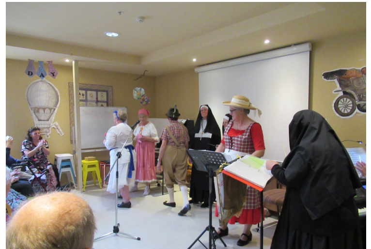
Regular entertainers, The Unforgettables, dazzled residents once again!