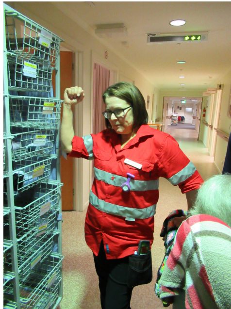
Staff got into the spirit for "Transport" dress up day! What fun!